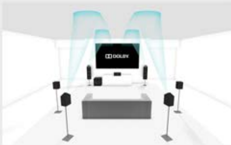
7.1.4 Perspective Detail

This refers to how many overhead or Dolby Atmos enabled speakers you can use in your Dolby Atmos capable setup.