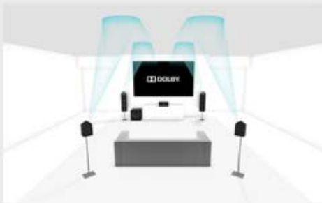
5.1.4 Perspective Detail

This refers to how many overhead or Dolby Atmos enabled speakers you can use in your Dolby Atmos capable setup.